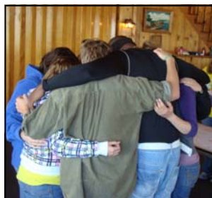
Students Praying for their Campuses

“...if my people, who are called by my name, will humble themselves and pray...”