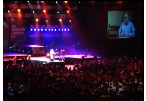
URBANA 09 held in St. Louis Ram's Football Stadium/Convention Centre