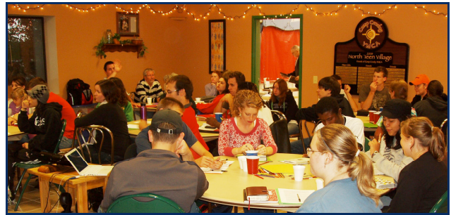
Students at Fall Retreat Large Group Session

The theme for the 2010 N. IN IV Fall Retreat was "On Campus On Purpose". 25 students from 4 universities gathered the first weekend of October for a weekend to get away from campus, get focused on Jesus and his mission, and get revitalized through worship and fellowship. We had 3 large group times of worship and Bible study where we looked at Daniel 1, 3, and 6. There was great student sharing at a bonfire on Saturday evening and community building recreation on Saturday afternoon. I directed the retreat again this year and taught the Daniel 6 session. Students were challenged to live on campus with a missional purpose!