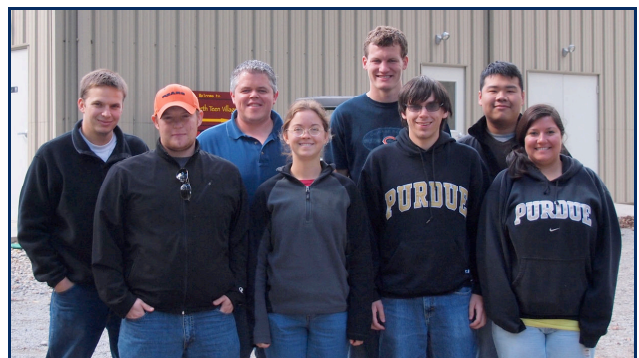
Purdue Students at Fall Retreat

The theme for the 2010 N. IN IV Fall Retreat was "On Campus On Purpose". 25 students from 4 universities gathered the first weekend of October for a weekend to get away from campus, get focused on Jesus and his mission, and get revitalized through worship and fellowship. We had 3 large group times of worship and Bible study where we looked at Daniel 1, 3, and 6. There was great student sharing at a bonfire on Saturday evening and community building recreation on Saturday afternoon. I directed the retreat again this year and taught the Daniel 6 session. Students were challenged to live on campus with a missional purpose!